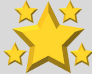
Gold Award 120+ hours

To find out more or register as a volunteer, go to www.abersu.co.uk/teamaber/volunteering