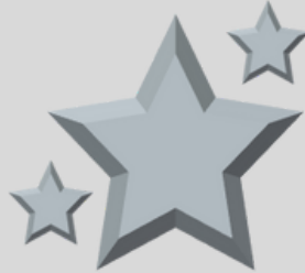
Silver Award 60-119 hours