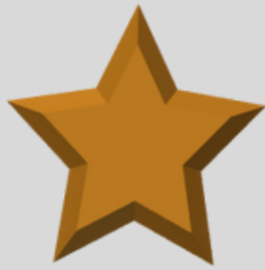
Bronze Award 30-59 hours

You can also work towards the one of our Aber Award certificates which celebrate all student volunteers by recording your volunteering hours and skills.